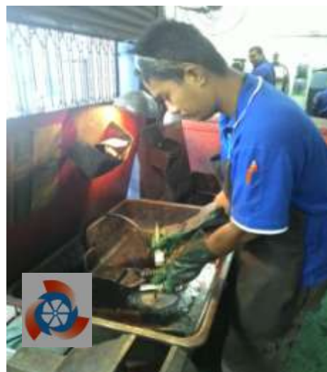
Wash item with diesel to clean from carbon